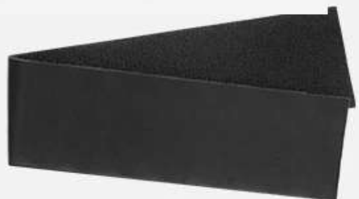
Belt: fixed pedals